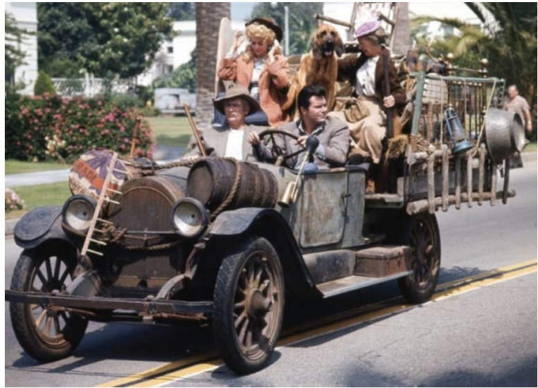
Early travelers on their way to striking it rich in the hills of Calico.